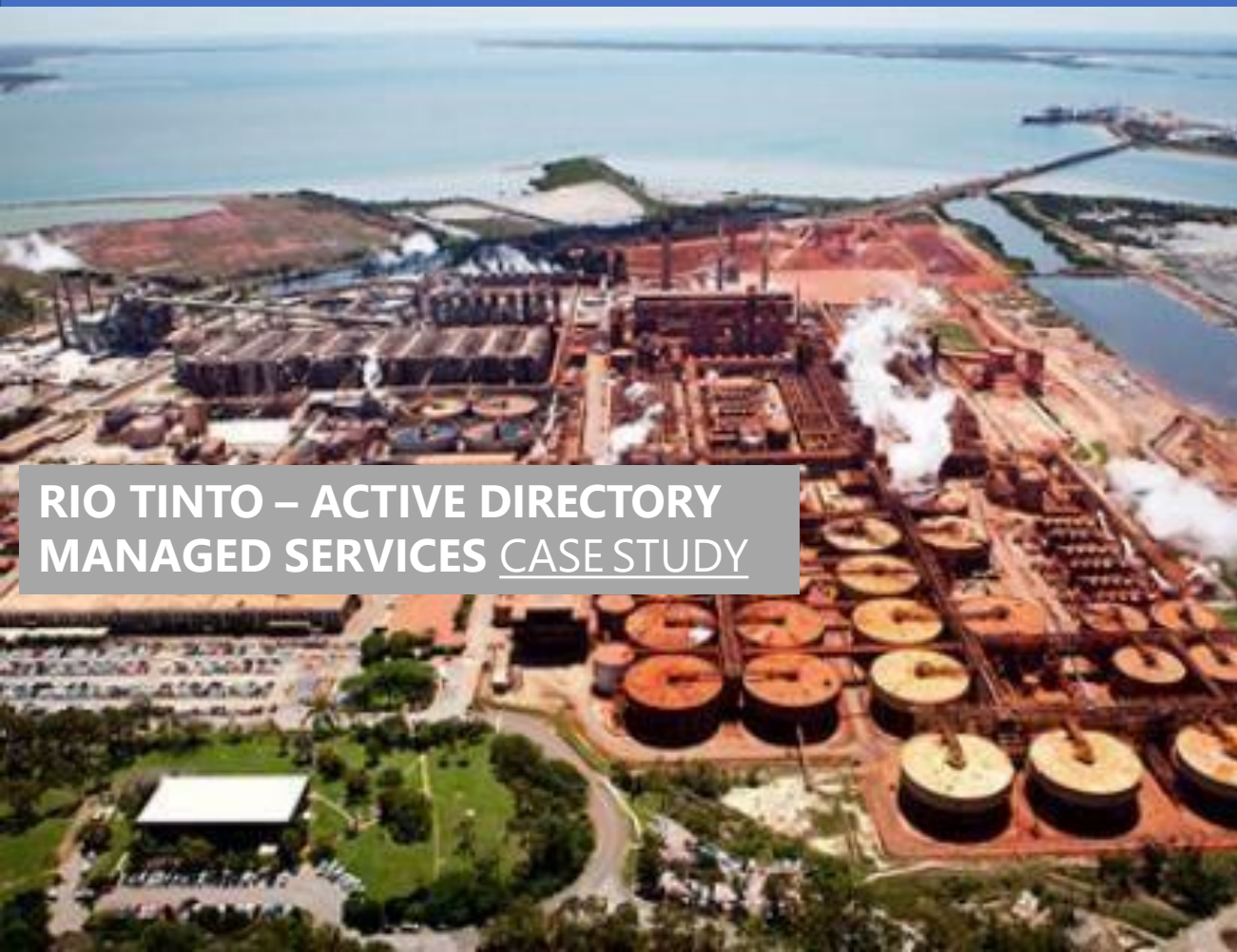
RIO TINTO – ACTIVE DIRECTORY MANAGED SERVICES CASE STUDY