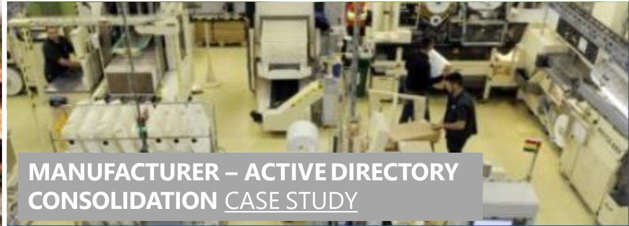
MANUFACTURER – ACTIVE DIRECTORY CONSOLIDATION CASE STUDY